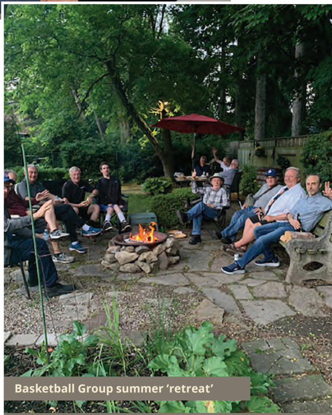
Basketball Group summer 'retreat'

The Basketball Group enjoyed weekly Zoom meetings, as well as their three traditional celebrations throughout the year: Christmas in January, a BBQ in June and a cottage weekend in September.