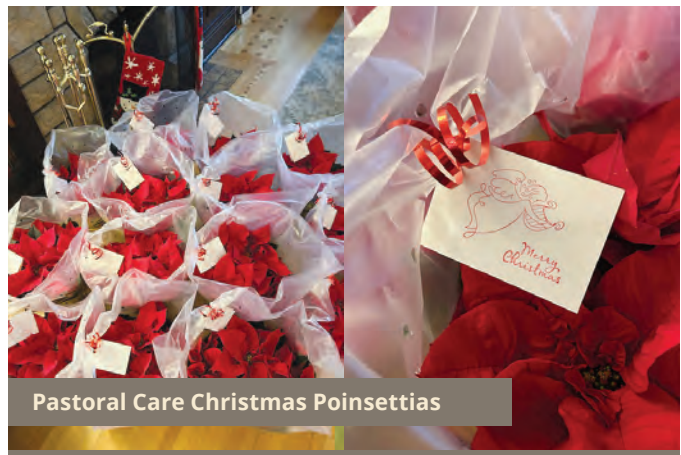
Pastoral Care Christmas Poinsettias