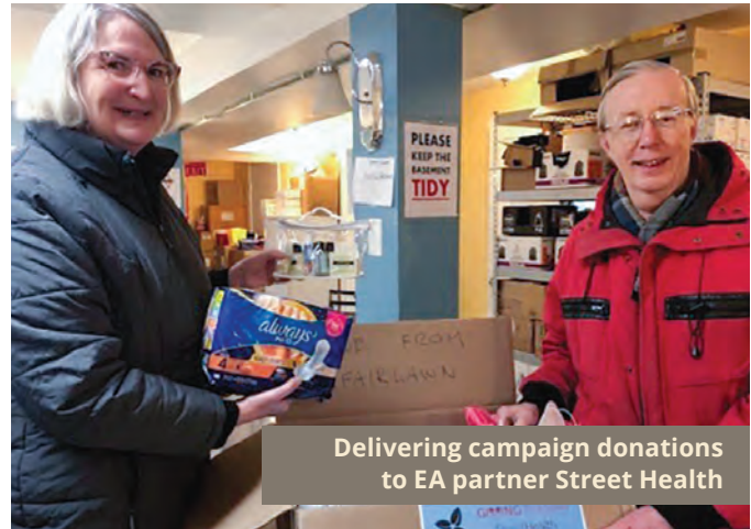
Delivering campaign donations to EA partner Street Health

Mission Moments in Sunday Services and contributions to Greetings! continue to highlight the work of EA and encourage greater volunteer participation.