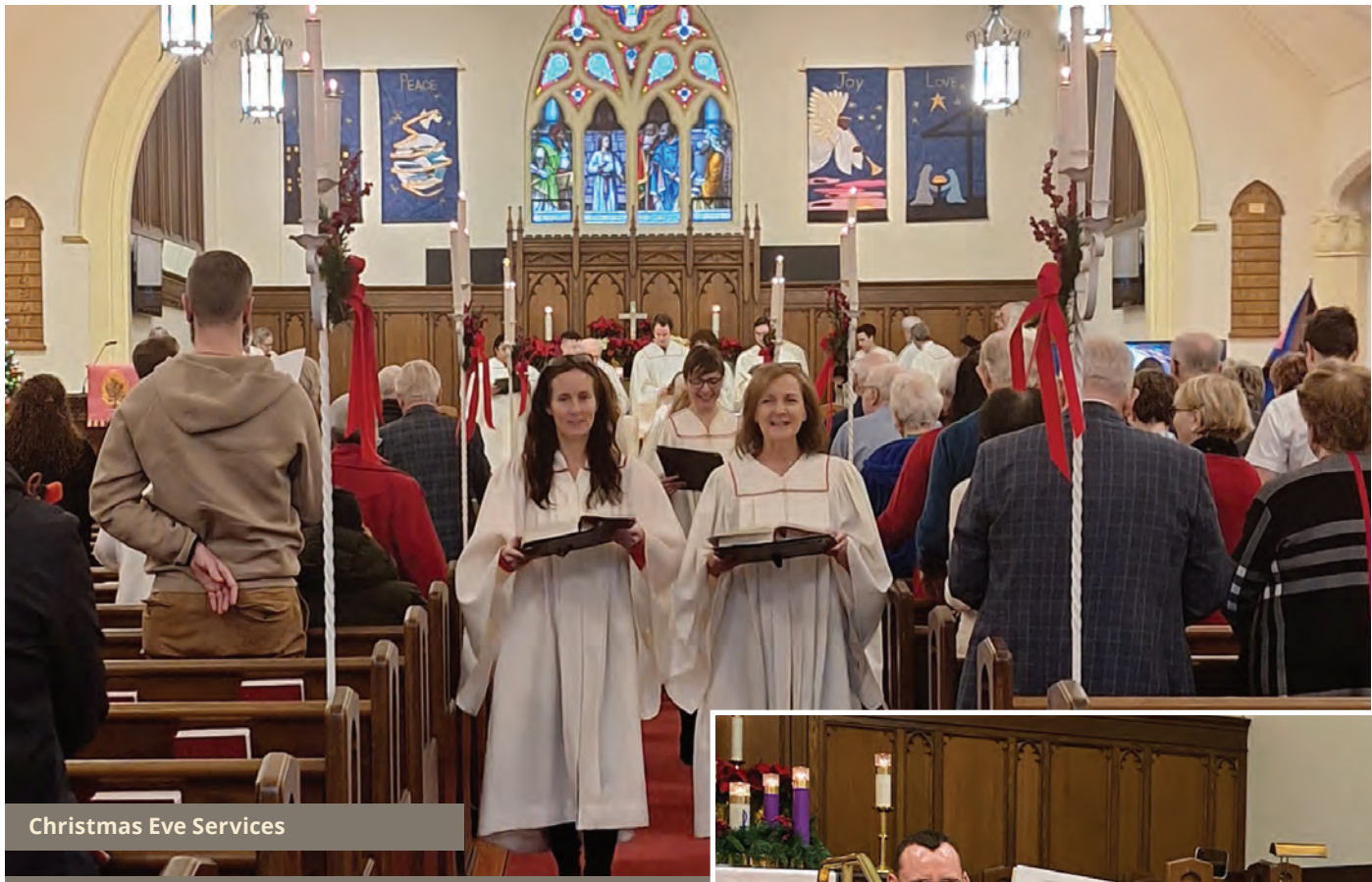
Christmas Eve Services