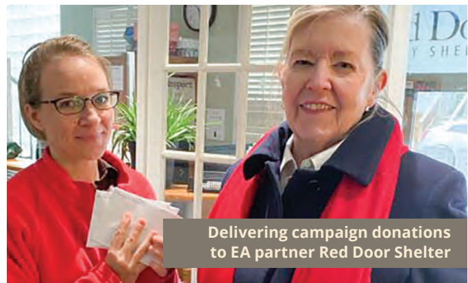
Delivering campaign donations to EA partner Red Door Shelter