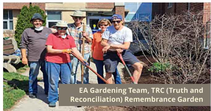
EA Gardening Team, TRC (Truth and Reconciliation) Remembrance Garden