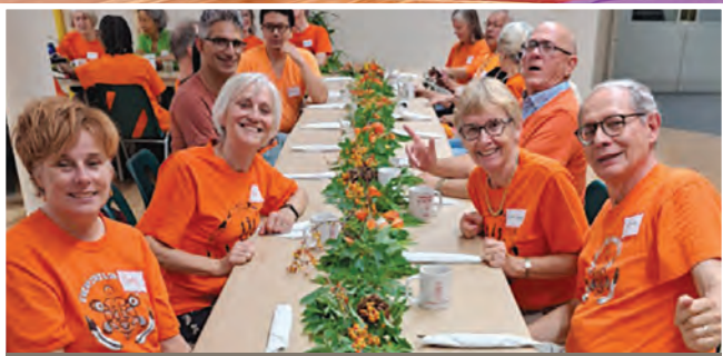
Orange Shirt Day - Water Walk and Feast