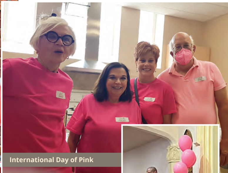
International Day of Pink