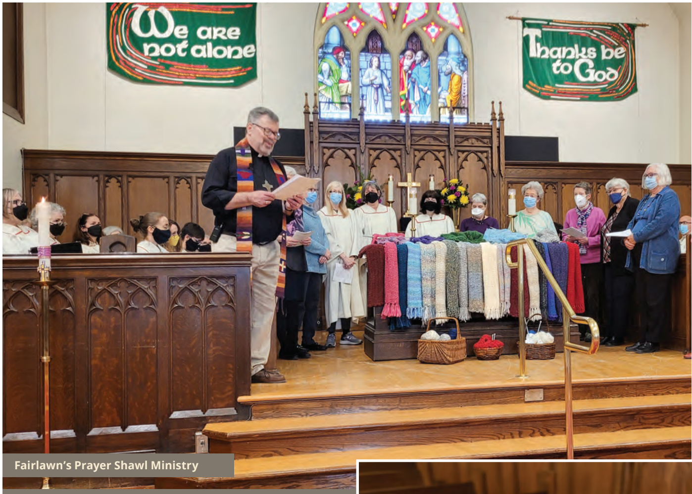
Fairlawn's Prayer Shawl Ministry